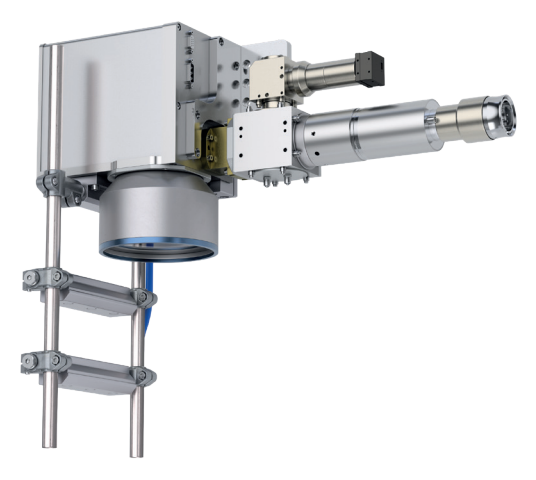
Welding head with horizontal fiber feed and CU f220, FU f163, camera & double air knife

Welding head with vertical fiber feed and CU f120, FU f255, camera & single air knife